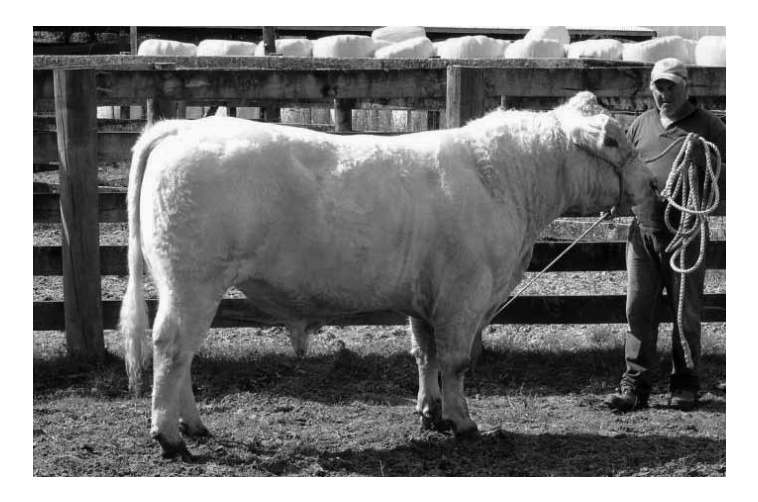
Photos: Supreme Champion Shorthorn (EO Pryce Memorial Cup) -Corsock Dazzler 11384